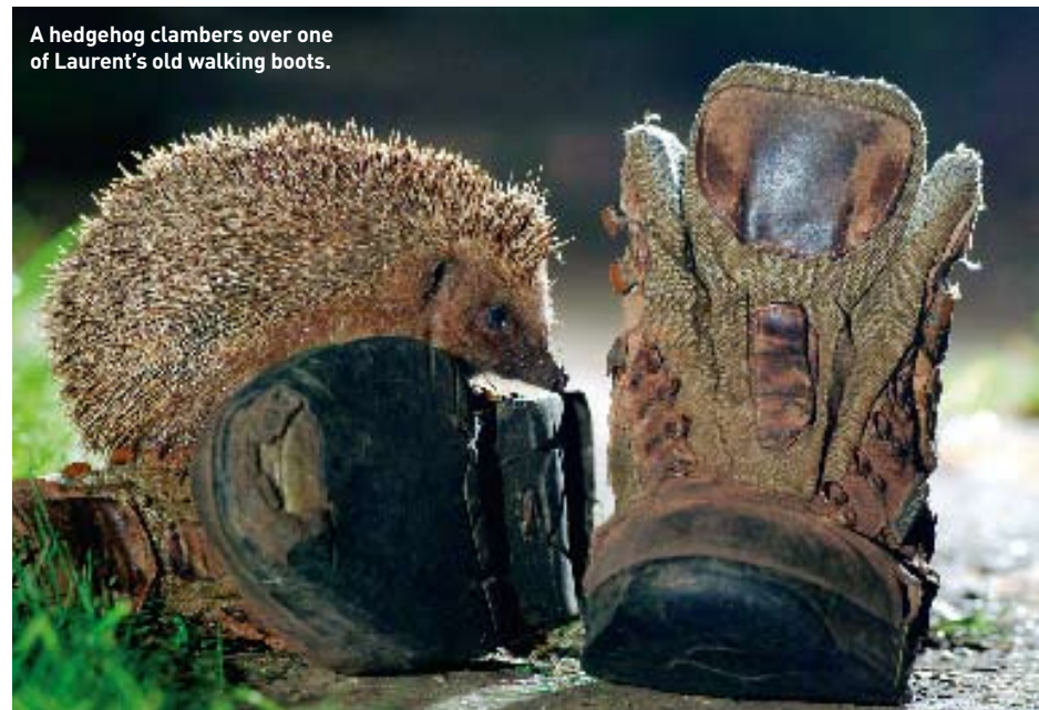
A hedgehog clammers over one of Laurent's old walking boots.