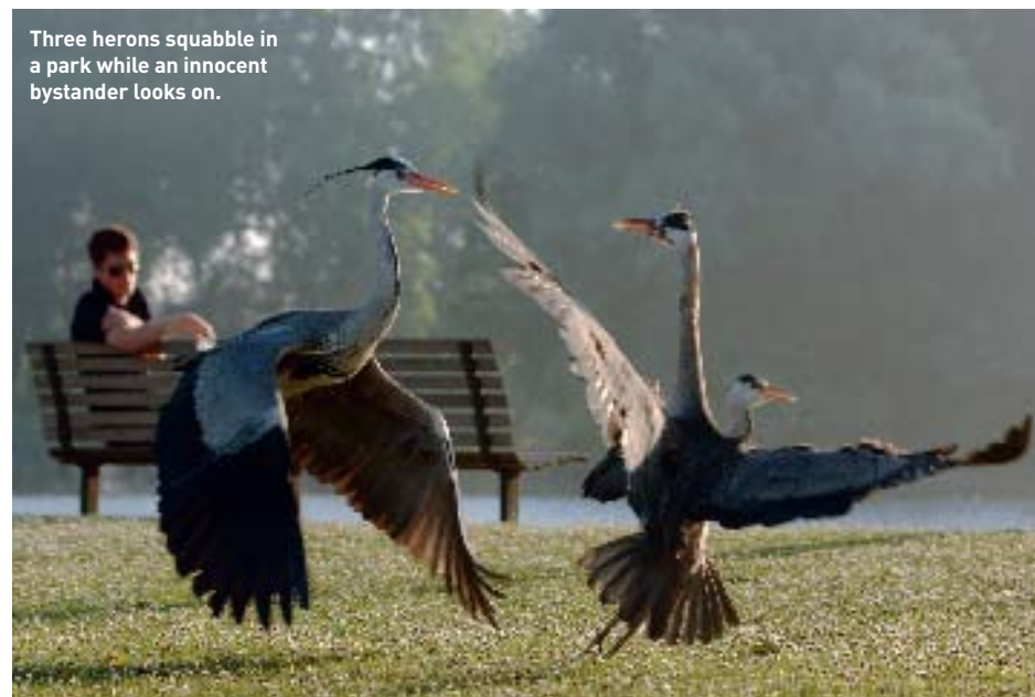
Three herons squabble in a park while an innocent bystander looks on.

There are many excellent books on wildlife gardening that provide plenty of good advice, but there are four golden rules – grow endemic plants, put out feeders, don't be too tidy and never use pesticides. If you have the space, it's also worth building a simple pond – it will pay dividends in photo opportunities.