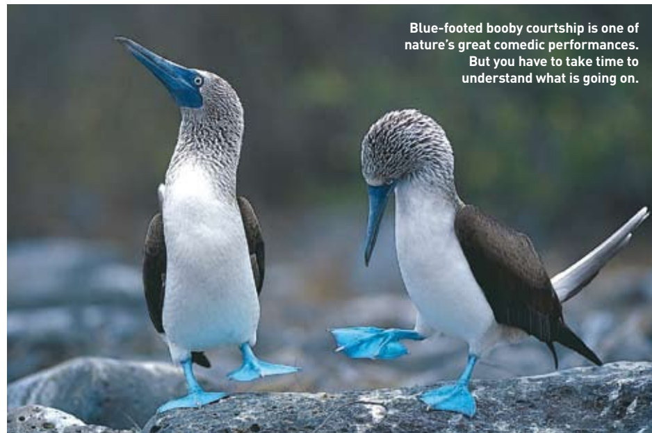
Blue-footed booby courtship is one of nature's great comedic performances. But you have to take time to understand what is going on.