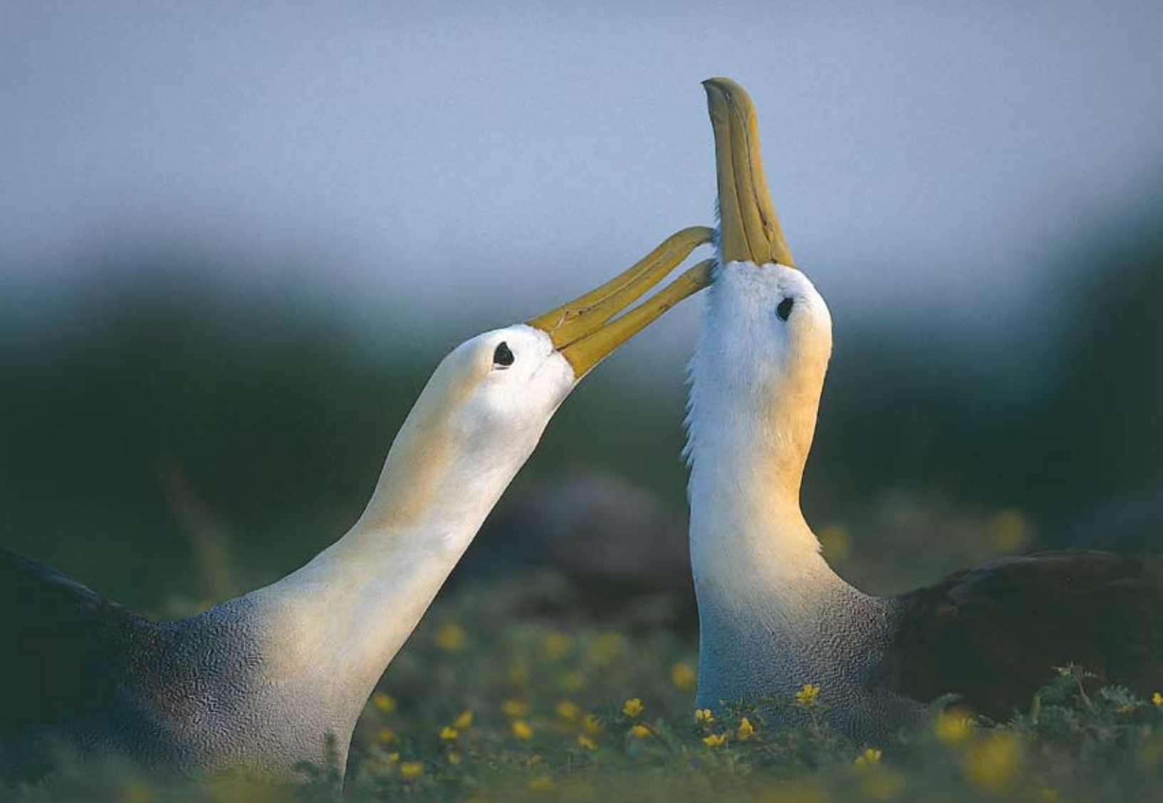
PHOTO MASTERCLASS PART NINE BIRD PORTRAITS