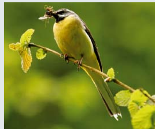
'BIRD PORTRAITS' WINNER: Darren Chaplin This grey wagtail with a freshly caught mayfly is beautifully composed, with perfect light. The soft focus foliage in the distance provides the ideal backdrop.

RULES 1) The competition is open only to amateur photographers. 2) Up to eight entries only per person. 3) Entry of a picture constitutes a grant to BBC Worldwide to publish it in all media. 4) Entries will be judged by BBC Wildlife . 5) The winning image will be published in the February 07 issue. 6) No correspondence will be entered into and winners will not be notified. 7) Entries will not be accepted by post or email.