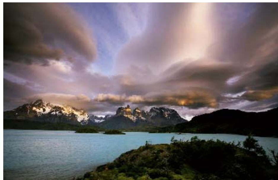
Limpid blue water, hard granite peaks and a glowering sky give a fantasy feel to this Chilean landscape.

The most important aspect of any photography is to find fresh perspectives. Don’t be lazy and take the pictures that are obvious to everyone. Work hard. Think laterally. Find new angles, wait for better light, look for interesting behaviour, vary the shutter speed and aperture – anything to avoid the classic ‘bird on a stick’ shot.