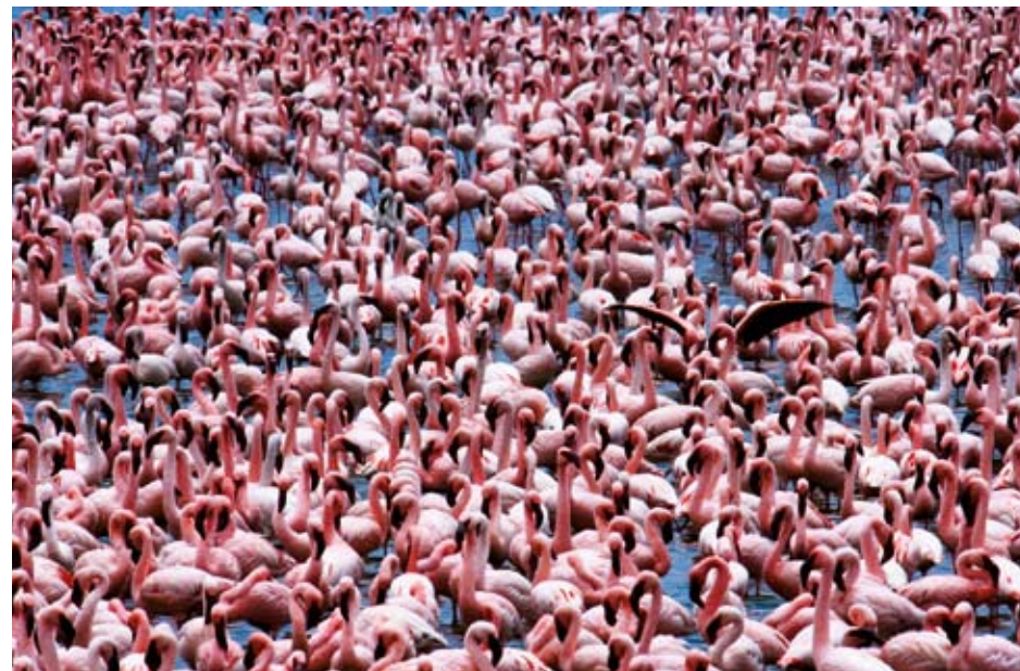
An abstract image of lesser flamingos on Lake Natron creates an intriguing pattern.