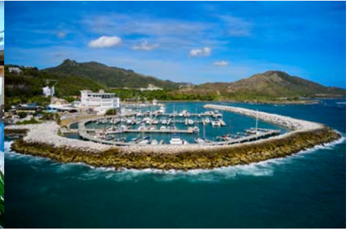
Ocean World Marina