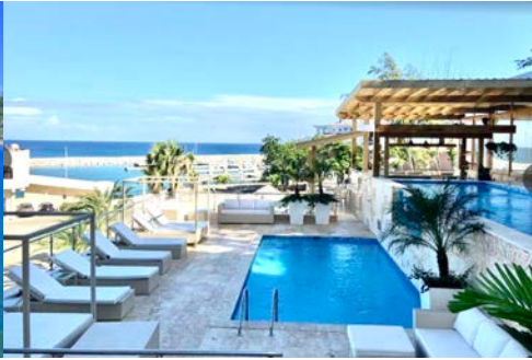
Cofresi Hills Residence, Puerto Plata